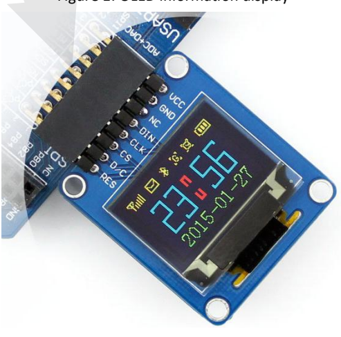
Figure 1: OLED information display

Connect module to the SPI2 interface of Open103R development board, power up. OLED displays information shows as below.